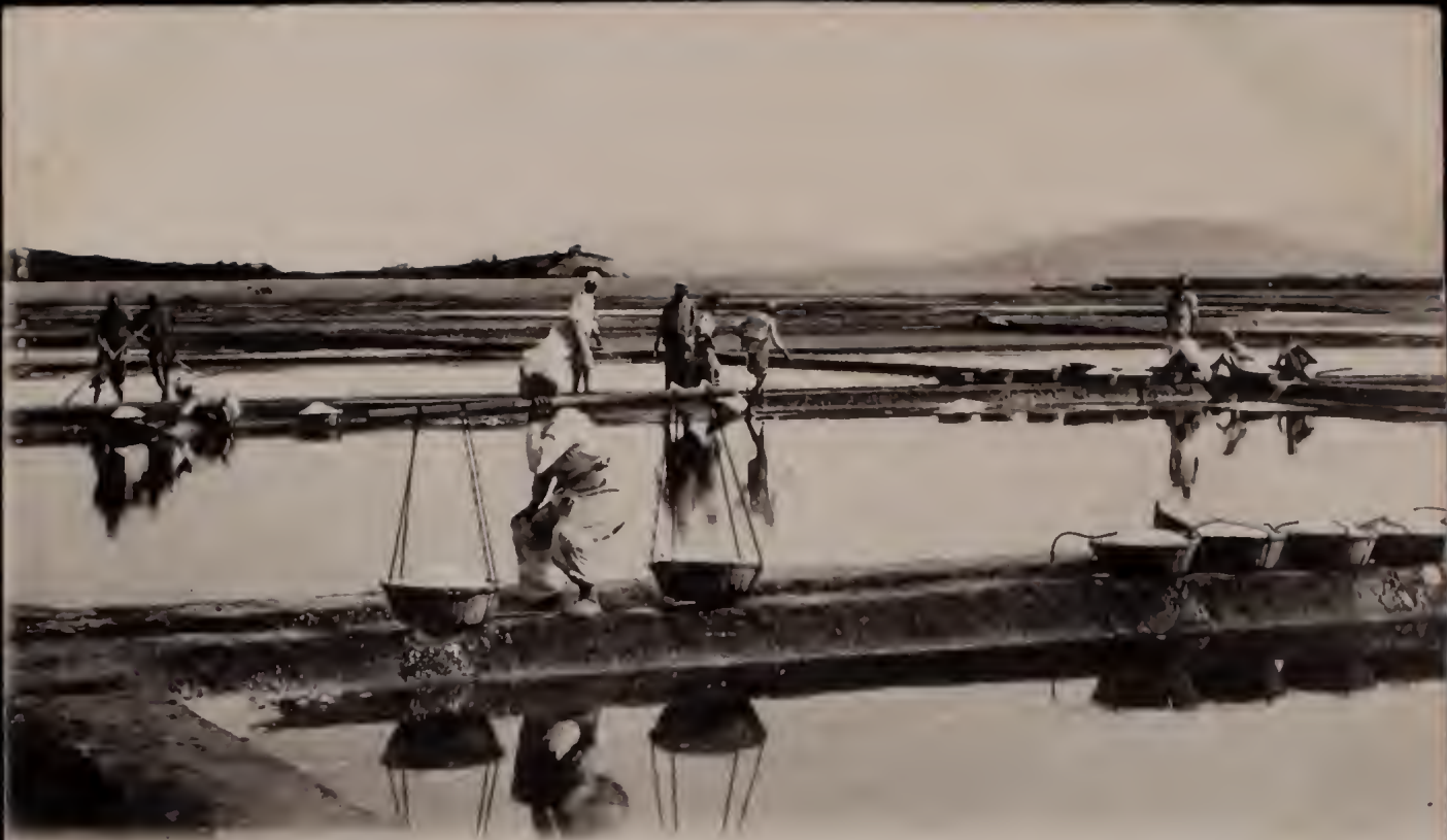
(平南 31) VIEW OF SALT BEACH WHERE SALT IS MADE 取鹽の田鹽灣梁廣 (所名鮮朝)